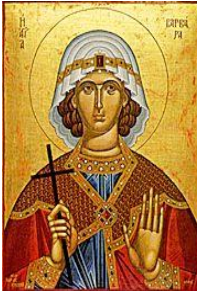
Barbara the Great Martyr