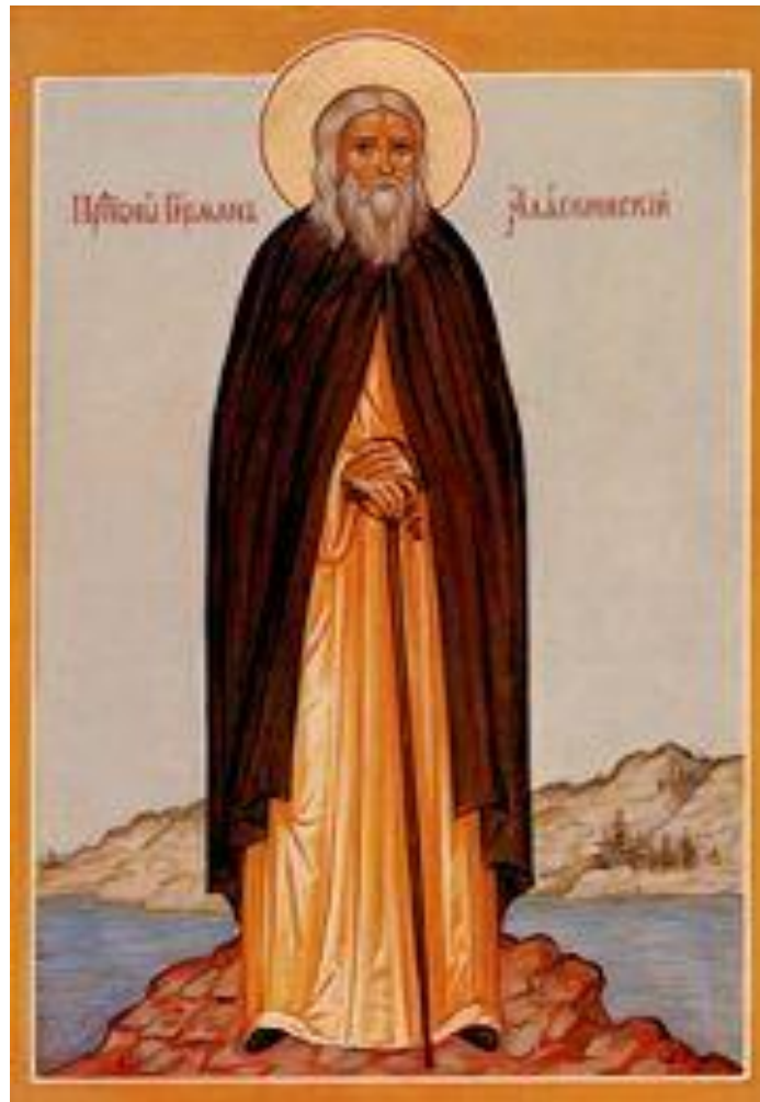
Herman the Wonderworker of Alaska and the First Saint of America