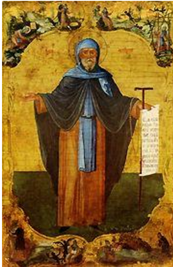
Anthony the Great

Saint Anthony, the Father of monks, was born in Egypt in 251 of pious parents who departed this life while he was yet young. On hearing the words of the Gospel: "If thou wilt be perfect, go and sell what thou hast, and give to the poor" (Matt. 19:21), he immediately put it into action. Distributing to the poor all he had, and fleeing from all the turmoil of the world, he departed to the desert. The manifold temptations he endured continually for the span of twenty years are incredible. His ascetic struggles by day and by night, whereby he mortified the uprisings of the passions and attained to the height of dispassion, surpass the bounds of nature; and the report of his deeds of virtue drew such a multitude to follow him that the desert was transformed into a city, while he became, so to speak, the governor, lawgiver, and master-trainer of all the citizens of this newly-formed city.